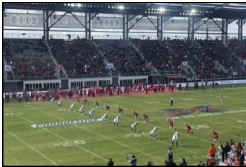
Just one week after the Super Bowl, the XFL debuted their comeback season, the first in 19 years. While experimental rules and special on-field access and interviews are different than the traditional NFL set up, the idea of football sticking around appealed to many fans

Nineteen years after the first incarnation, the XFL returned this last weekend and made their season debut. The XFL is a professional American football league which ran for a single season in 2001, but it's finally back. The XFL had doubtful thoughts throughout the debut weekend, but they actually received a positive reaction.