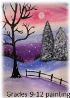
Grades 9-12 painting