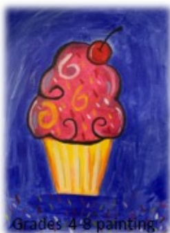
Grades 4-8 painting

Join me at the Zion Lutheran Church Basement Friday, February 14 th Grades 4 th - 8 th session at 1pm – 3pm Grades 9 th -12 th session at 4pm – 6pm